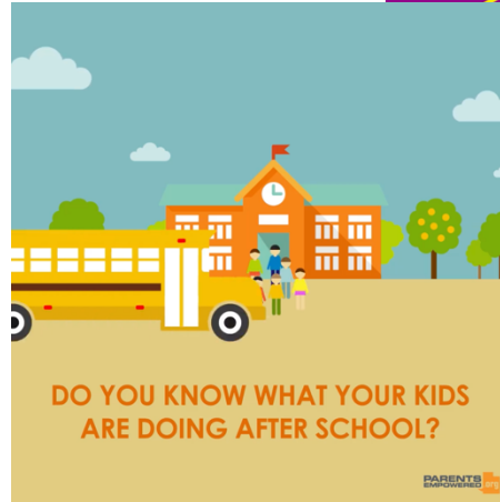
Media Campaigns focusing on Bonding