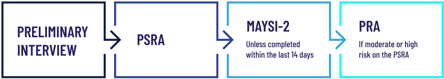
TABLE 2. REFER TO PROSECUTOR FOR SCREENING AND REVIEW